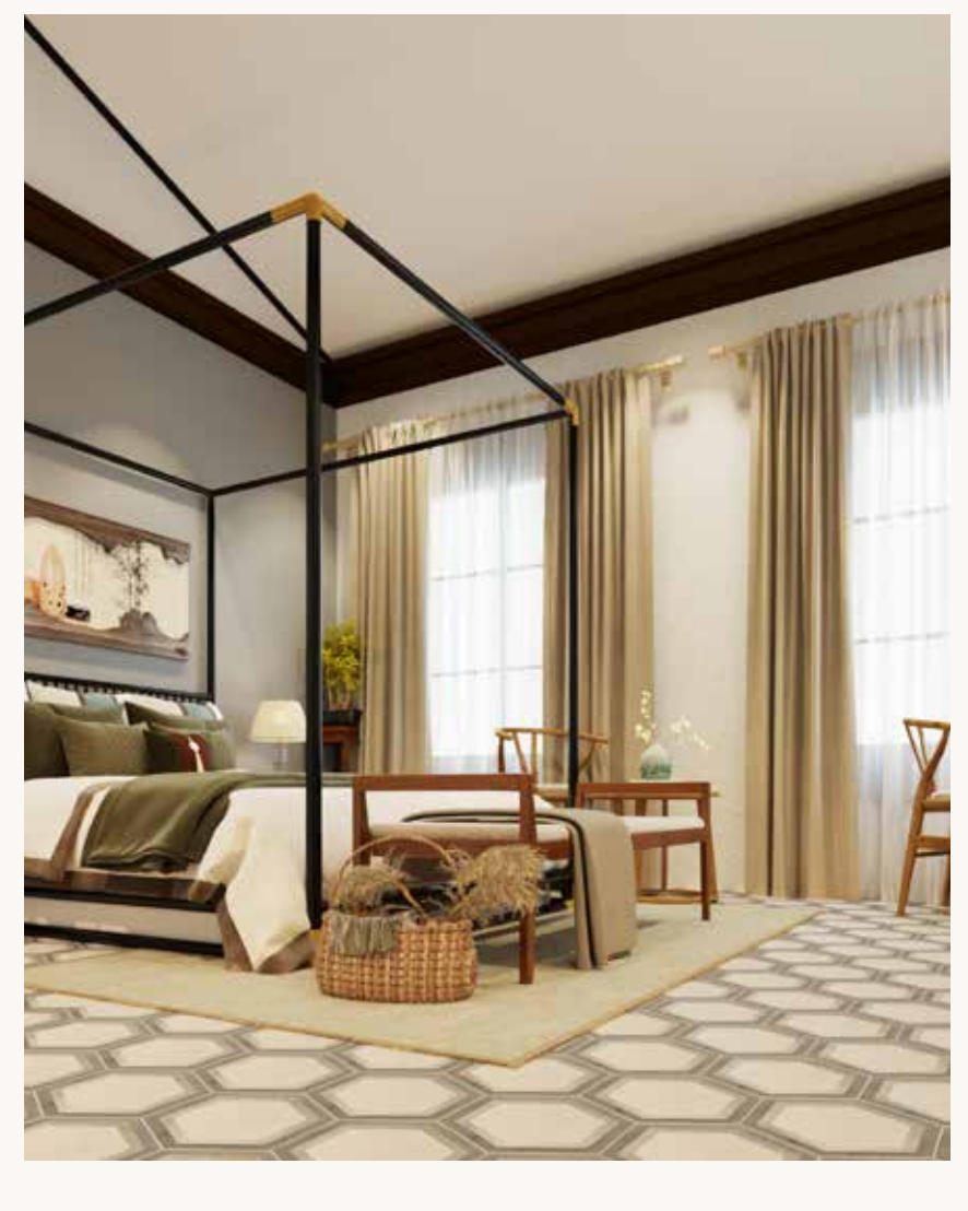
THERE'S LUXURY IN THE DETAILS. WE ALWAYS MAKE SURE TO CAREFULLY PICK AND USE QUALITY PRODUCTS IN OUR CONSTRUCTION TO ENSURE THAT YOU ALWAYS HAVE A SEAMLESS INTERACTION WITH YOUR INTERIORS.