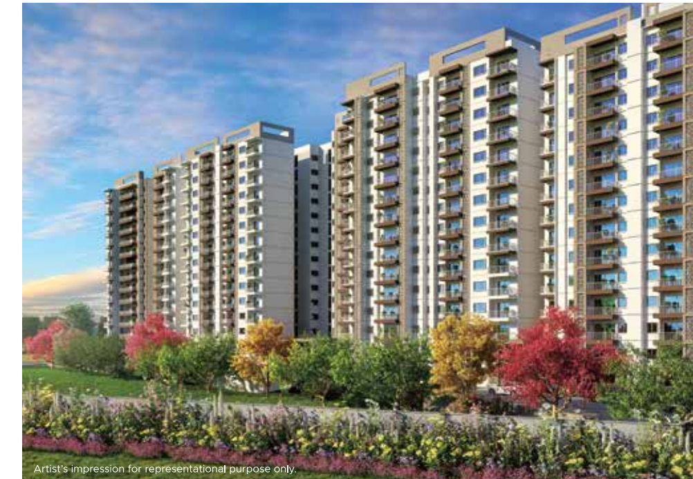
Artist's impression for representational purpose only.

A part of a mixed-use development spread across 65 acres, the project is located in the serene locales of Hebbal, Bengaluru. It has world-class amenities and ample greenery is the hallmark of this project.