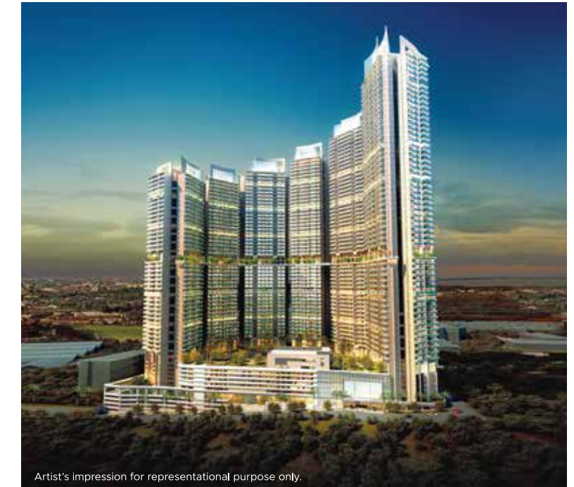
Artist's impression for representational purpose only.

Inspired by the shape of the crescent moon, the 6 magnificent towers at Crescent Bay, Parel come with a Sky Deck and a jogging track perched on the 21 st floor.