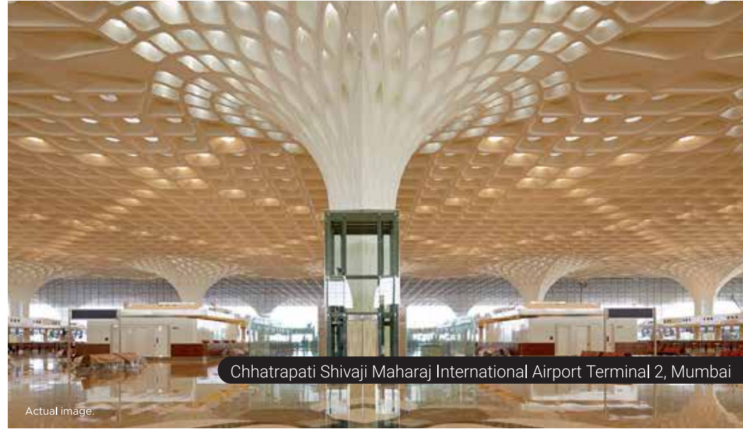
Chhatrapati Shivaji Maharaj International Airport Terminal 2, Mumbai