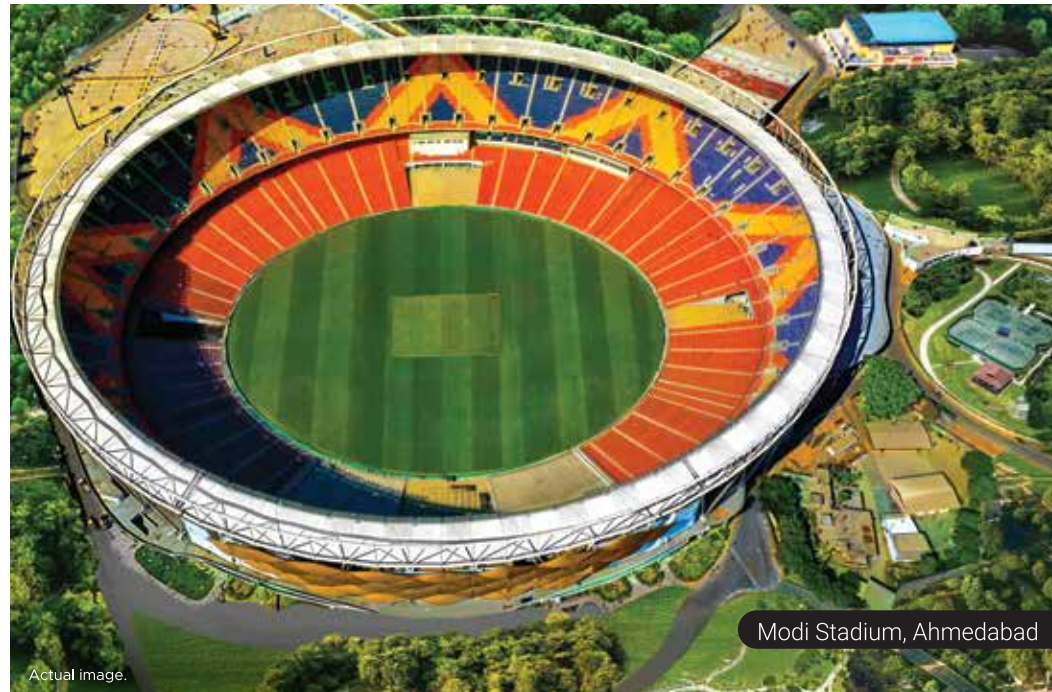
Modi Stadium, Ahmedabad

Larsen & Toubro is an over USD 21 Billion conglomerate. You've seen this name on megastructures, gigantic construction sites and in the headlines - reporting benchmark setting projects in India and abroad. From our earliest days of manufacturing to our most recent projects, L&T has been a critical part of India's growth. Today, many of India's iconic buildings, airports to IT parks, malls to monuments, carry our signature of excellence.