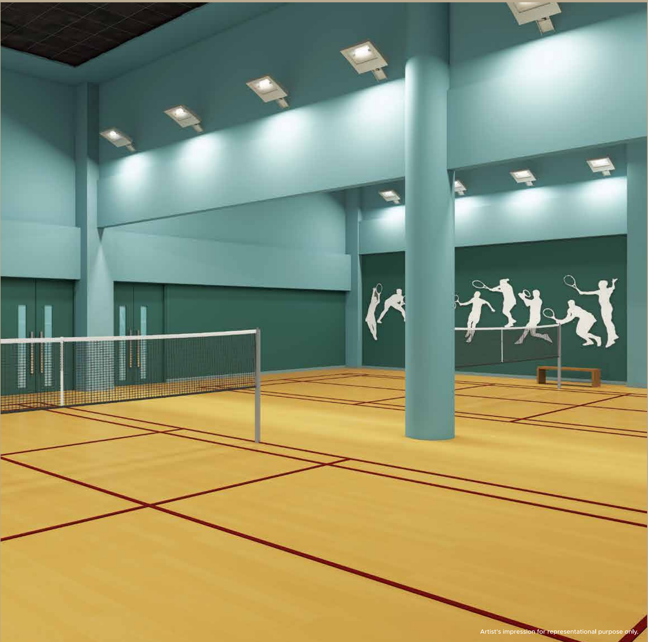
Artist's impression for representational purpose only