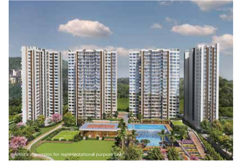
Artist's impression for representational purpose only.