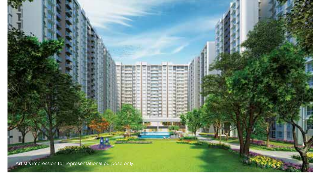
Artist's impression for representational purpose only.