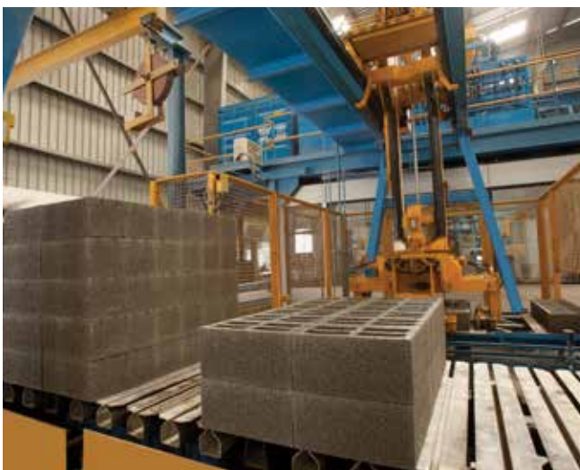
Concrete Products Division spread across 55,000 sq. ft.