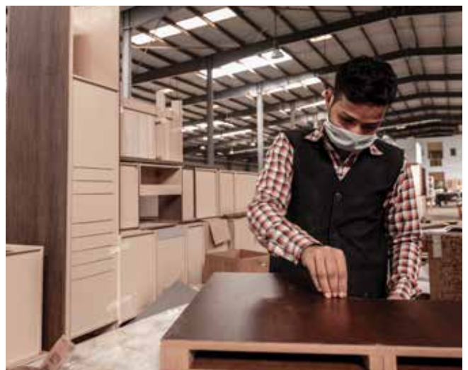
Interiors Division spread across 3,75,000 sq. ft.