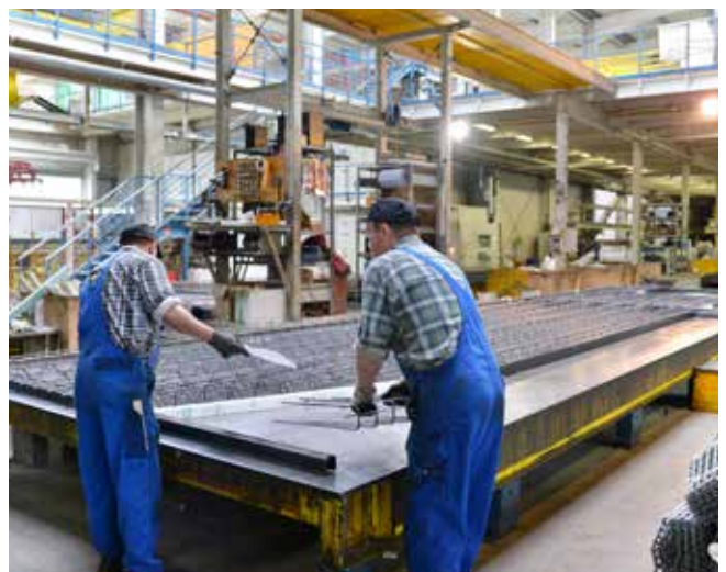
Precast Facility spread across 73,000 sq. ft.