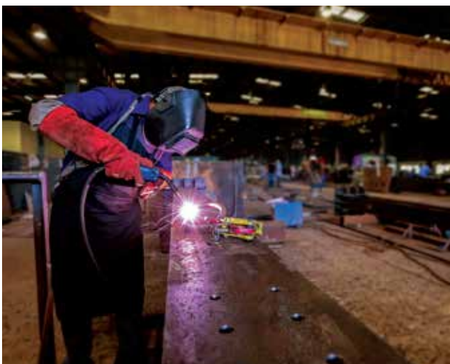
Glazing & Metal Works Division spread across 1,00,000 sq. ft.