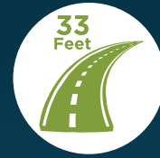
33 Feet Black Tar internal Roads