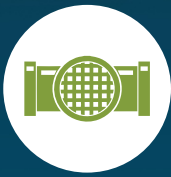
Underground Drainage System