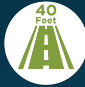
40 Feet Black Tar Main Roads