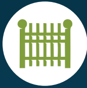
Fencing around the project