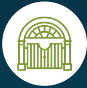
Beautiful Entrance arch